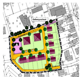
Pilot area (design)

Project overview and general process for energy concepts in planning processes