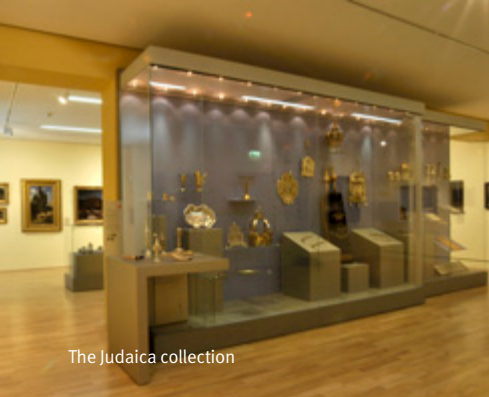
The Judaica collection