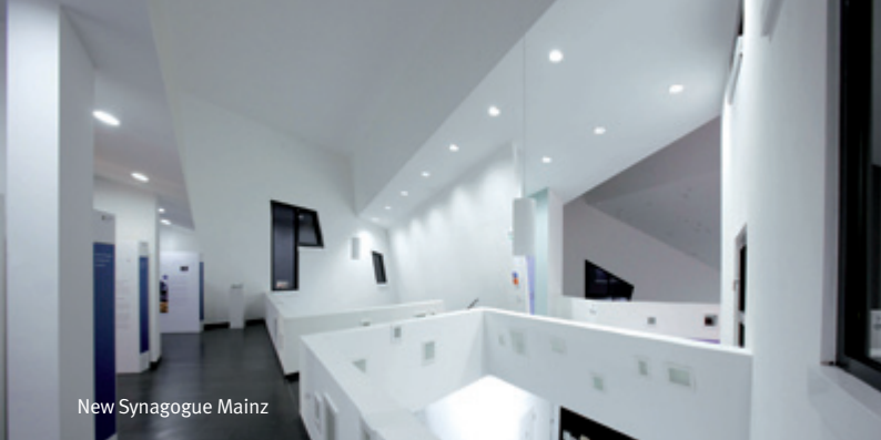
New Synagogue Mainz