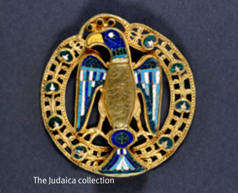
The Judaica collection