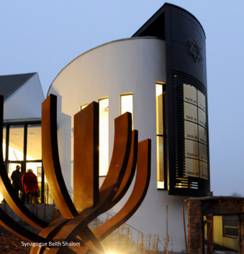
Synagogue Beith Shalom