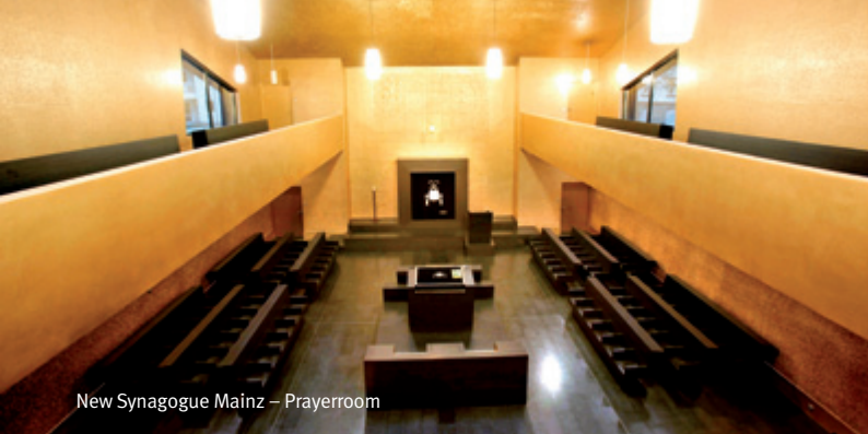
New Synagogue Mainz – Prayerroom