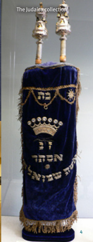
The Judaica collection